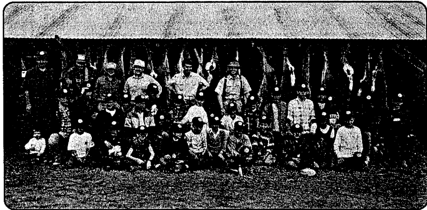
Club Members with Hunters

Young hunters from the Masonic Home in Fort Worth and the Wichita Falls area came to Jack County to hunt deer last November. The hunt was sponsored by the Sportsmen's Club of Fort Worth and the Northwest Texas Field and Stream Association. Twenty eight hunters killed fourteen deer during the one evening and one morning sessions. Happy faces with deer blood on