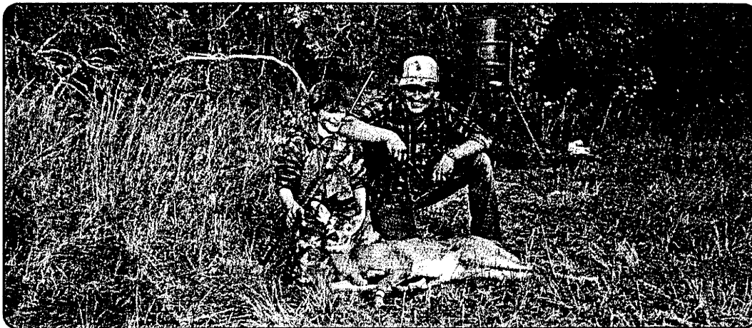
Happy Hunter With First Deer

Hospitality Hour 6:00-7:00 Dinner 7:00 Business Meeting 7:30